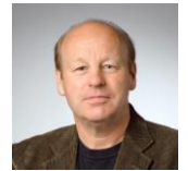
Click for Trevor's Video

In tough times and good, everyone needs to contribute to the success of an enterprise - your engineers, executives, sales leaders, consultants, project managers, customer services, marketing professionals - just some of the many people who will improve your results by using the APEX ™ Model of Influence